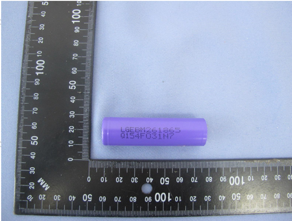
Figure 3 Overall view of cell (电芯图)